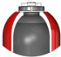
TOP REPAIRABLE (TR) OPTION

Carbon steel standard. Also available in stainless steel, carbon fiber, and with a wide variety of protective coatings. Contact us for more information.